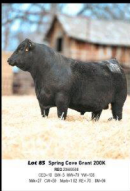
Lot 85 Spring Cove Grant 200K REG 2062624 CED+8 BW+3 WW+71 YW+102 Milk+27 CV+59 Marb+32 RE+31 SM+58